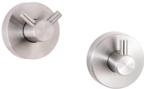
B-549 Surface-Mounted Double Coat Hook

Satin-finish stainless steel. Holds two toilet tissue rolls. 14-gauge shelf features upward return on front edge.