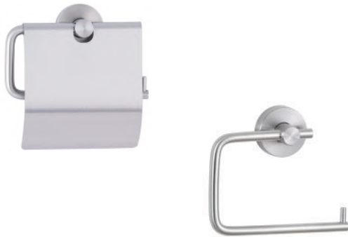
B-546 Surface-Mounted Single Roll Toilet Tissue Dispenser with Hood

This suite of products adds convenience and style to any washroom or toilet cubicle. Featuring contemporary styling, the models share common elements such as coordinated threaded escutcheons and post diameters.