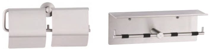
B-548 Surface-Mounted Double Roll Toilet Tissue Dispenser with Hoods

B-5436 Similar to B-543, but with bright-polished finish.