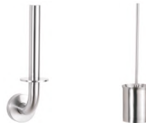
B-541 Surface-Mounted Spare Toilet Roll Holder

B-5426 Similar to B-542, but with bright-polished finish.